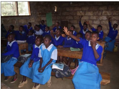
Children listen attentively to a bible lesson

Due to the presence of FHI in the school, children from neighbouring schools are joining Nkunga primary school. This has led to the increase in the number of students attending the bible study in the school. All volunteers