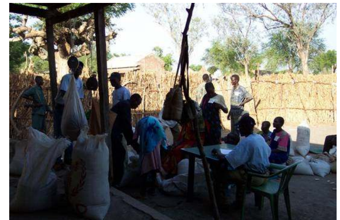
Seed sellers bring their stocks to Old Fangak to be weighed before the start of sale.

The economy of the area is based mainly on livestock, agriculture and fishing. One year ago, FHI staged the first seed fairs in Upper Nile. These were the first large scale non-military events seen in over 20 years. In 2006, we are staging 8 more seed fairs, which are 5 times larger than those of 2005 due to better access and the reduction of conflict. 7 tons of seed (mainly sorghum and maize) were generated in 2005 and this is expected to rise to 30 tons in 2006.